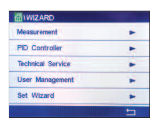
As easy as 1, 2, 3: Intuitive operation – in a few steps you get to sophisticated setup routines like PID control.